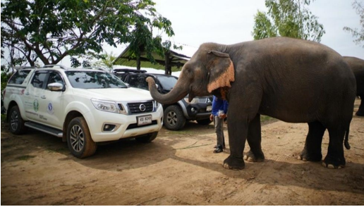
Elephant from Surin Province surveys CMU Van's trunk space

villages and the mobile clinic is spending much more time on the road to care for these elephants.