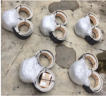
Five of six radio collars deployed in Sumatra

AES provided support for a project to deploy a total of six GPS collars on wild elephants in Way Kambas National Park in southern Sumatra.