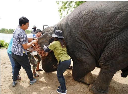
Veterinarians and Mahouts performing blood draw

In the photos from Surin province, you can see the doctors helping the local men and women perform blood draws from the elephants' ears, which helps in determining an elephant's overall health.