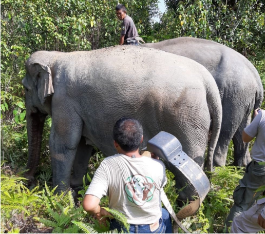
Preparing to fit new radio collar on a Sumatran elephant

Our field partners have informed us that all six GPS collars are working well and providing regular information on elephant movement to the National Park authorities, thereby helping prevent conflict with villagers whose farmland adjoins the National Park.