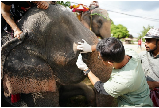
Uthai Thani Province elephant receiving care for an eye issue

Looking ahead, the two veterinarians will be able to travel to an extended area in northern Thailand, and be able to cover for each other for emergencies, on weekends and holidays.