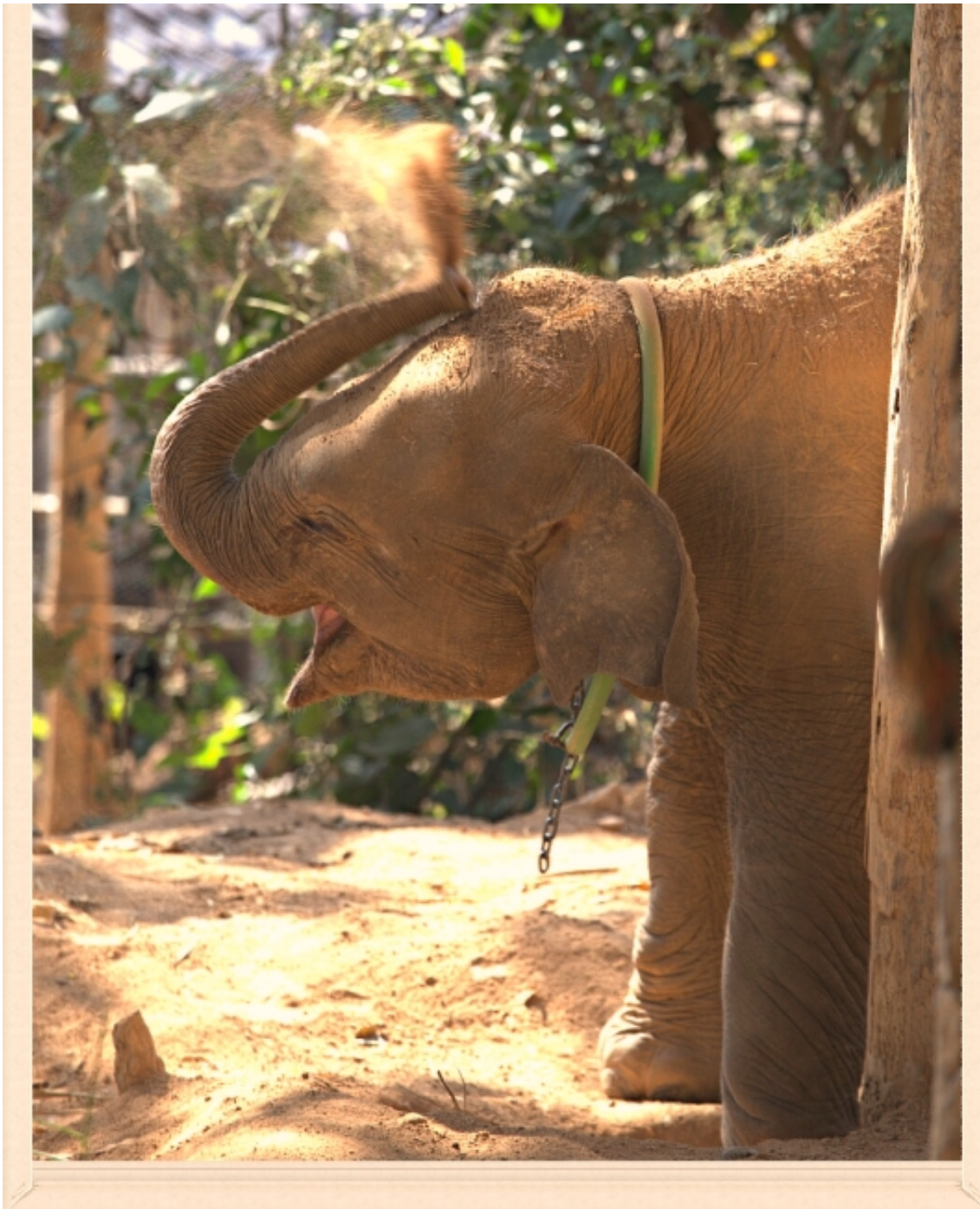
Noy enjoying a dust bath.