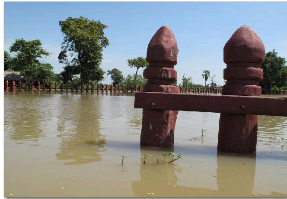
Field where the elephants used to sleep

To see more photos of the flood, go to http://www.elephantstay.com/elephantstayflooded.html .