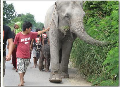
Snacking on the way