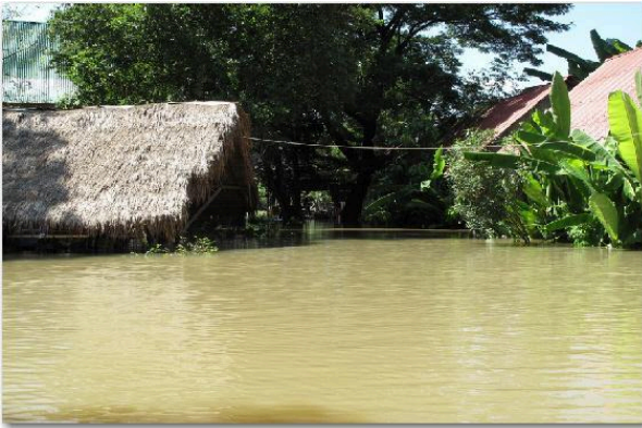
Elephantstay team hut

Flooding meant evacuation for both people and elephants. The mothers and babies are in the historic Kraal. Some of the dangerous elephants are up near the Kraal. Other elephants are about a mile down the road, where they went in 2006. The road to that place is half closed as well due to flooding. The people who live and work with the elephants have moved to wherever they need to be to provide care. The cost for recovery will be high and the work will be hard. On top of the damage from floodwaters, they have had to turn away many visitors, over 500,000 baht, so it has been devastating on all fronts.